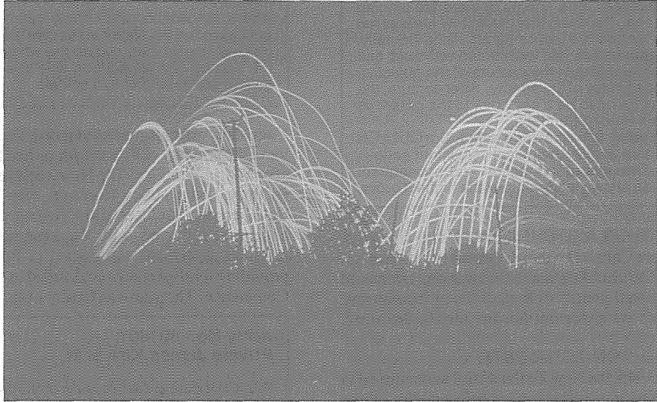
The scene characteristics in the New Zealand Divisional area near TRIESTE on the night that the news that the war with Germany was over.

With the conclusion of the ceremonies, the men dispersed to their own Maraes throughout the country, to be welcomed again by their own tribes and kinsfolk.