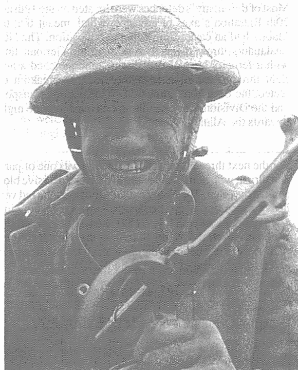
Smile of the big push. Soldier with captured German Tommy Gun, near Gazala